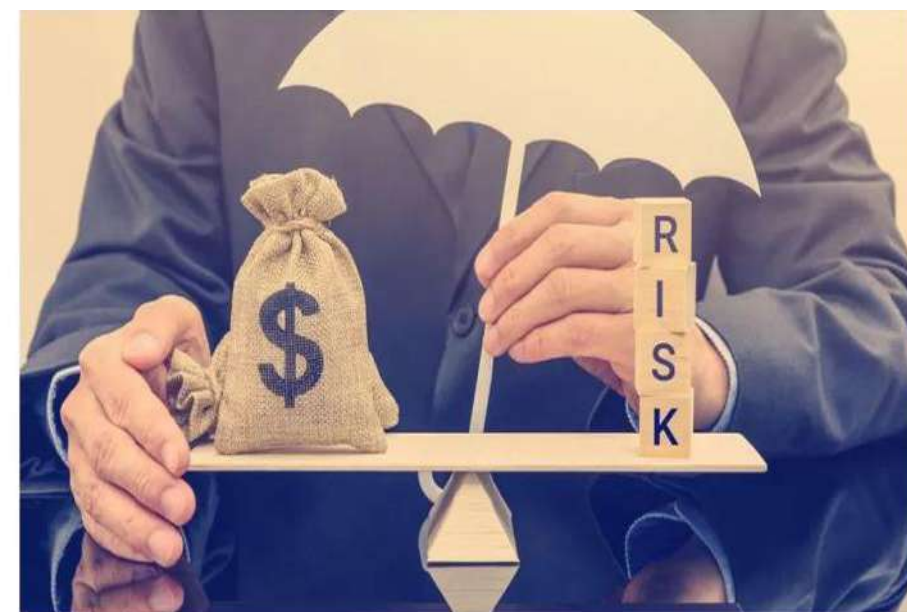
Leveraging Options & Derivatives In forex Risk Management

Versatile Strategies: Beyond simple call and put options, traders can implement strategies like collars, straddles, or strangles for more tailored protection.